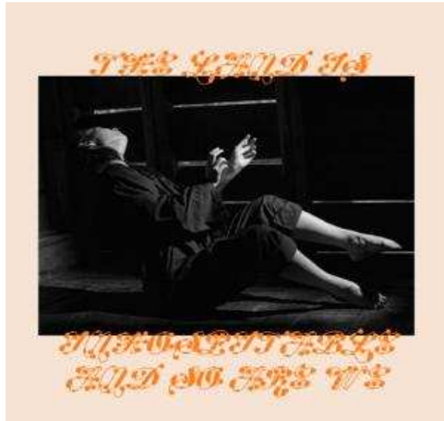
Figure 1. The Land Is Inhospitable and So Are We from Mitski cover album